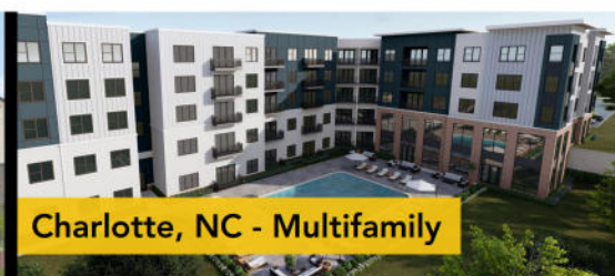
Charlotte, NC - Multifamily

Located in the highly walkable Downtown Knoxville, with astounding river views, and just a 5 minute drive to University of Tennessee.